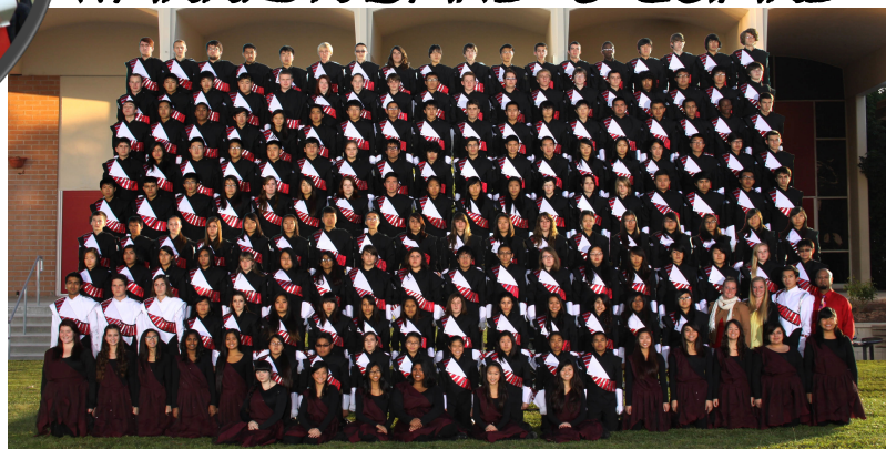
WARRIOR BAND & GUARD