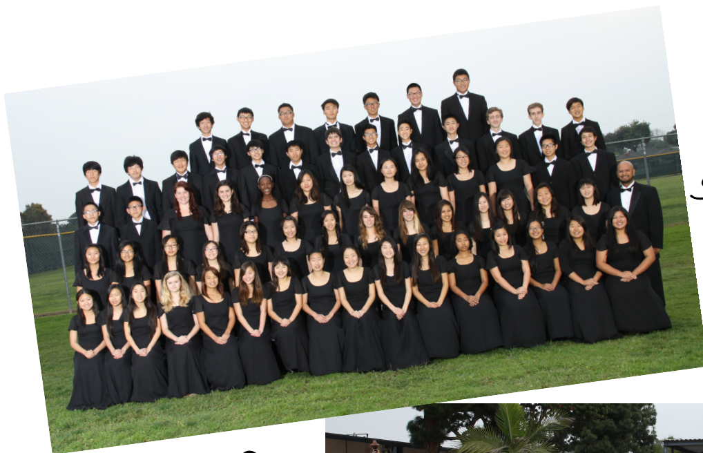
Symphony of Troy